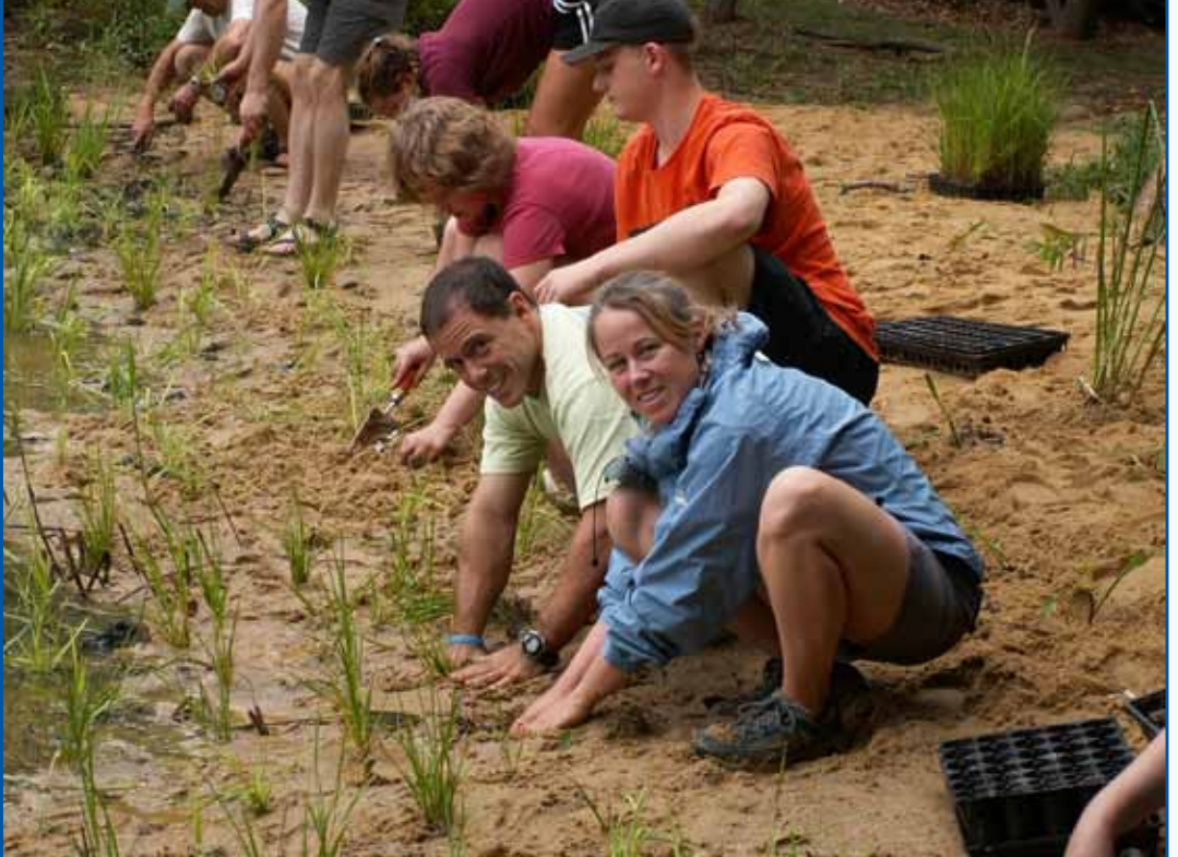
ABOVE: Re-flooding a marsh.