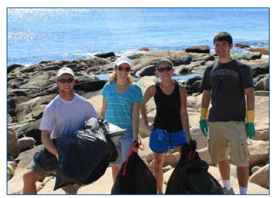
University of Rhode Island.

Saturday, October 15 was the "Big Sweep." Intrepid members of the ECU TCS Chapter joined with the ECU Student Subunit of the American Fisheries Society to clean up Green Mill Run, a tributary of the Tar River that runs through campus; lots of trash was collected! Looking forward to 2012 we are planning a film night and also to volunteer for other community events, including Greenville's Community Tree Day on Saturday February 11, 2012. More in the next Bulletin!