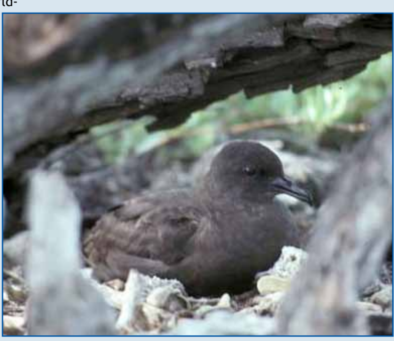
A Christmas shearwater (Puffinus nativitatis) on Cook Islet, Kiritimati, Line Islands, Kiribati.

October 20-24, 2012, Tampa, Fl www.estuaries.org/conference