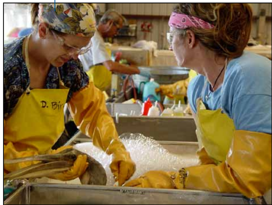
Cleaning an oiled baby Brown Pelican chick at Deepwater Horizon 2010 oil spill response the at Fort Jackson Bird Rehabilitation Center in Buras, Louisiana.

This article is adapted from testimony offered before the Subcommittee on Insular Affairs, Oceans and Wildlife, Committee on Natural Resources, U.S. House of Representatives, Hearing on State Planning for Offshore Energy Development: Standards for Preparedness June 24, 2010. The hearing video and written testimony is archived at http://resourcescommittee.house.gov/index.php?option=com_jcalpro&Itemid=27&extmode=view&ext id=360