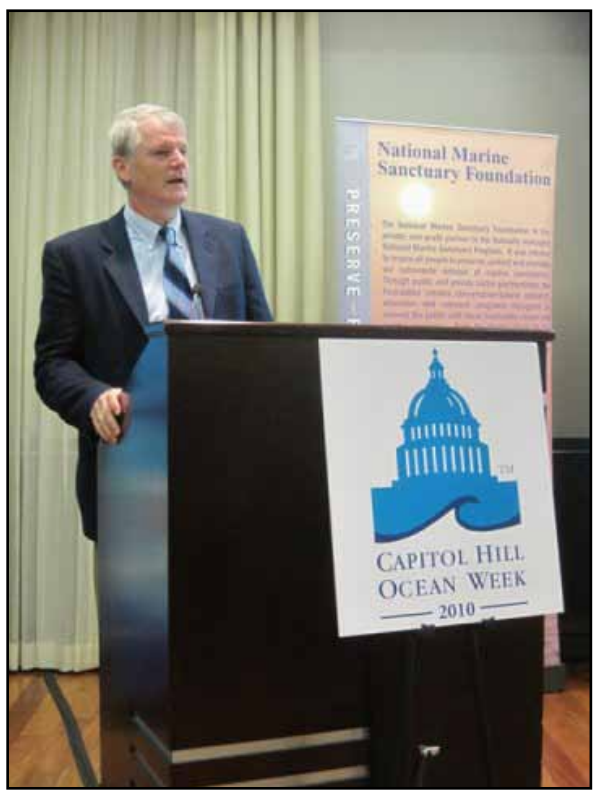
Representative Brian Baird.

Other elected representatives who spoke included Representative Robert Wittman (VA-01), Senator Sheldon Whitehouse (RI), Representative Mike Castle (DE-01) and Representative Brian Baird (WA-03). Baird, who is retiring from Congress, urged the audience to be sure and always bring up the problem of ocean acidification when speaking of global warming. Several panels discussed the market for alternative energy sources, including offshore wind, as well as "hydrokinetics," which embraces waves, tides and currents; congressional initiatives for a clean energy future; and ocean and energy policy in a changing arctic. Reference was made several times to the need for comprehensive planning to adequately protect important resources, while providing predictability to industry. The new National Ocean Policy is expected to provide the framework for this marine spatial planning. Chris Mann, a Senior Officer in the Pew Environment Group was unambiguous when he declared that the spill in the Gulf was a failure of technology, a failure of prevention and response, and a failure of governance. He urged the audience to use the outrage over this disaster to focus and to drive needed