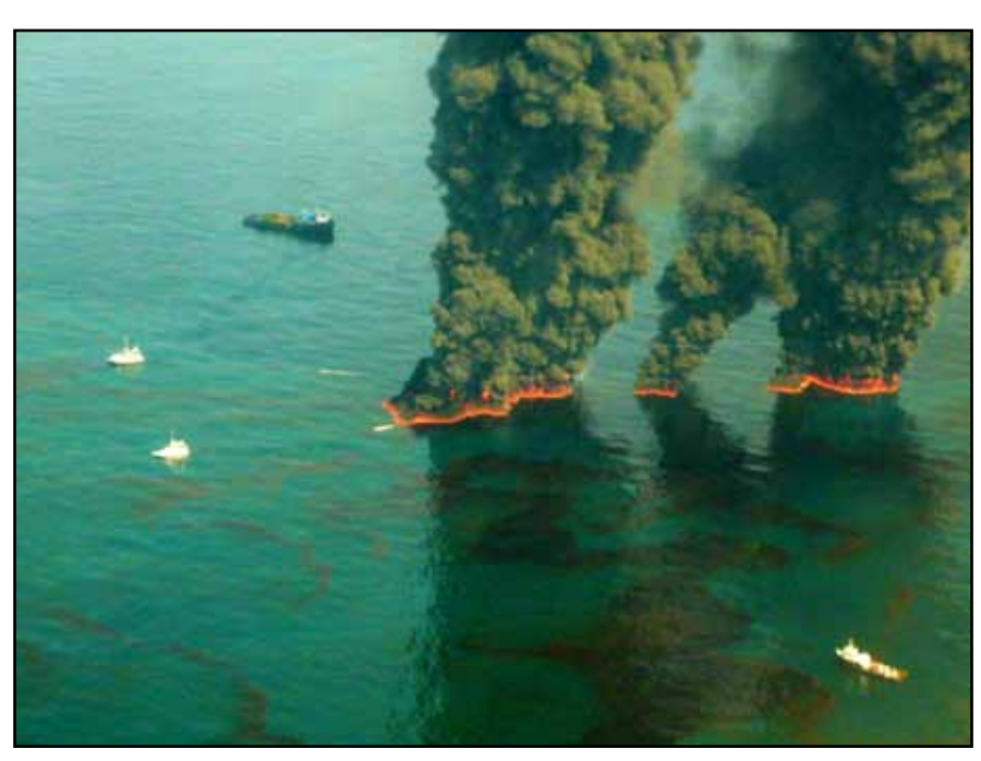
Clouds of smoke billow up from controlled burns taking place in the Gulf of Mexico May 19, 2010. The controlled burns were set to reduce the amount of oil in the water following the Deepwater Horizon oil spill.

For example, Alaska's consistency review of outer continental shelf (OCS) exploration provides opportunities to prepare for the unique Arctic conditions in that state. California's spill response standards were developed during state consistency review of oil and gas activities and served as a foundation for California's Oil Spill Preven-