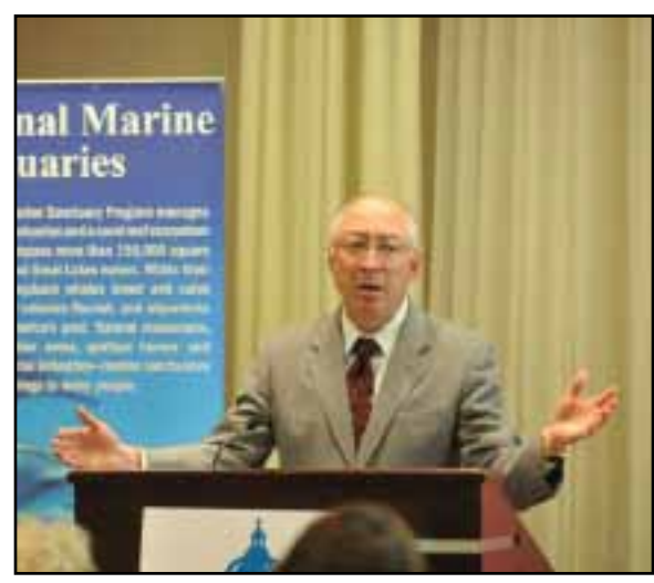
Secretary of the Interior Ken Salazar gives the opening keynote at Capitol Hill Ocean Week 2010.

sea urchins and oyster larvae are placed in differing conditions. The urchins proved fairly robust as water acidified, but when an additional stressor was added, i.e., heat, they were less tolerant than larvae raised in more typi-