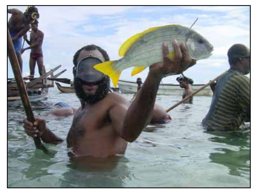
Fishing

The Surfrider Foundation take on the issue with this beginning, "It's getting crowded out there in the ocean. No, we're not talking about the lineup at your local