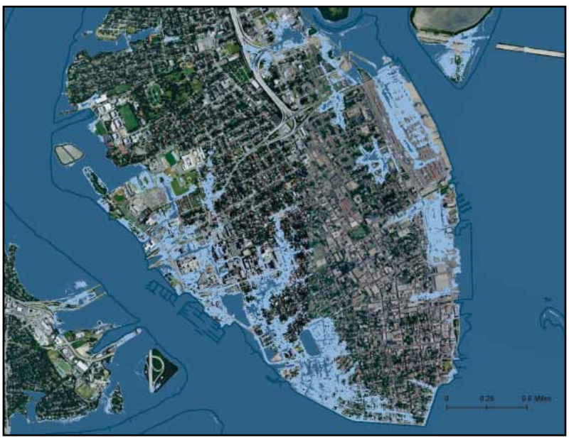
Potential inundation in Charleston, SC from shallow coastal flooding, with and without sea level rise: The map shows the scale of potential flooding, not the exact location, does not account for erosion or subsidence, and assumes no wind, rainfall, or future construction. The dark blue line shows the existing coast; the deep blue illustrates extent of flooding at current sea levels, during a 7 ft MLLW tide; the lighter blue areas show flooding extent during a 7 ft MLLW tide if sea level were to rise 1.6 ft, which could occur during the next 100 years.

Both tools were developed to meet the needs of agencies and organizations with limited resources but grow-