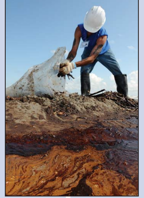
Worker loads oily waste onto a trailer just west of Grand Isle, LA. May 21, 2010.