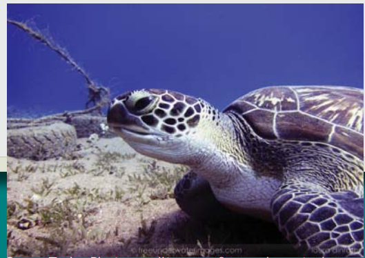
Green Turle

The views expressed herein are those of the authors and do not necessarily represent TCS nor its Board.