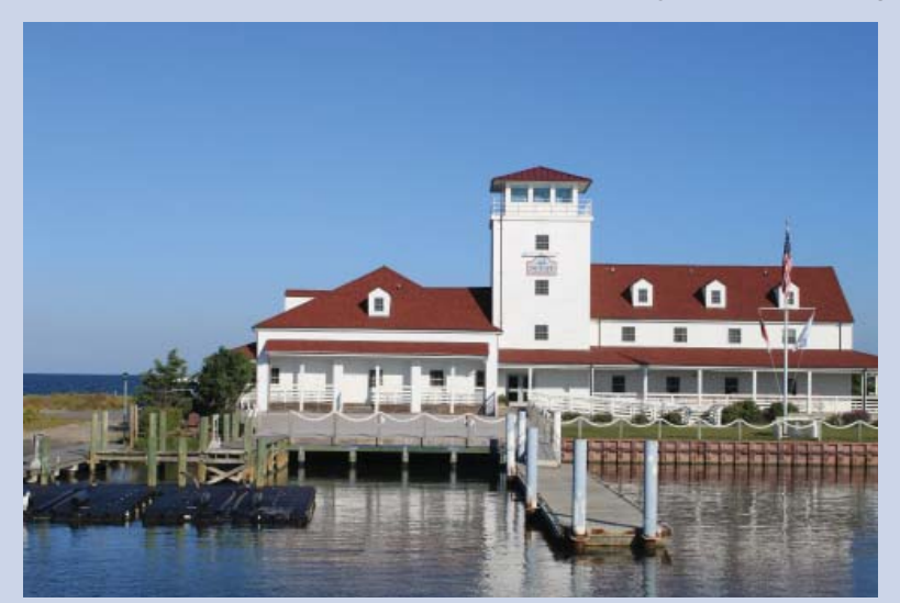
North Carolina Center for the Advancement of Teaching, Ocracoke Island, NC.

13th National Conference on Science, Policy, and the Environment: Environmental Disasters: Science, Preparedness, and Resilience January 15-17, 2013, Washington, DC, US