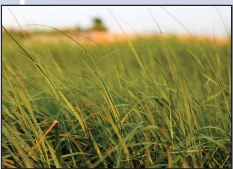
Sea Grass

The British oil company agreed to pay $4.5 billion in fines and other penalties and to plead guilty to 14 criminal charges related to the rig explosion two years ago that killed 11 people and caused a giant oil spill in the Gulf of Mexico. The US government said that BP's negligence in sealing an exploratory well caused it to explode, sinking the Deepwater Horizon drill rig and unleashing a gusher of oil that lasted for months and coated beaches all along the Gulf Coast. The company initially tried to cover up the severity of the spill, misleading both Congress and investors about how quickly oil was leaking from the runaway well, according to the settlement and related charges. While the settlement dispels one dark cloud that has hovered over BP since the spill, it does not resolve what