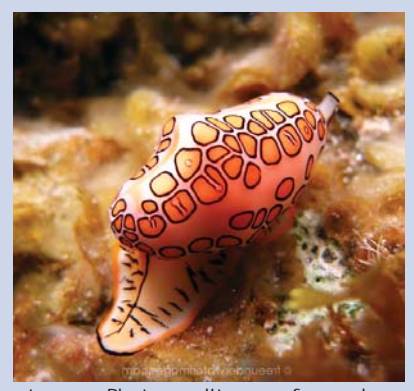
Flamingo\ tongue.\ Photo\ credit:\ www.freeunderwaterimages.com

I Guard 1,000m. However, at one of our sampling sites, we discovered that this point was reached at 200m depth. Marine snails—pteropods--live in this top layer of the ocean," said Nina Bednaršek of NOAA. Climate models forecast more intense winds in the Southern Ocean this century if CO2 continues to increase, which will make the mixing of deep water with more acidic surface waters more frequent, the study said. This will make calcium carbonate reach the upper surface layers of the Southern Ocean by 2050 in winter and by 2100 all year round, said the study's co-author Dorothee Bakker, research officer at the University of East Anglia. http://planetark.org/enviro-news/item/67213